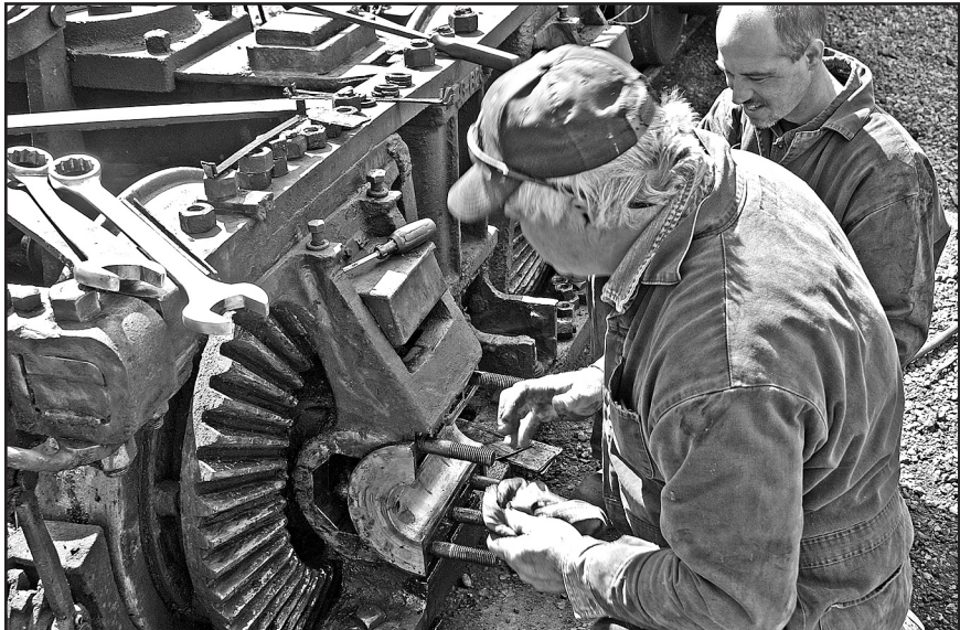
Inspecting the Shay #9 bearings outside the engine house at Silver Plume, Colorado on March 21, 2011.