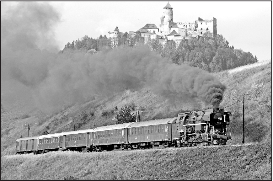
A 4-8-4 tank locomotive passing a castle high above on the mountain in Slovakia.