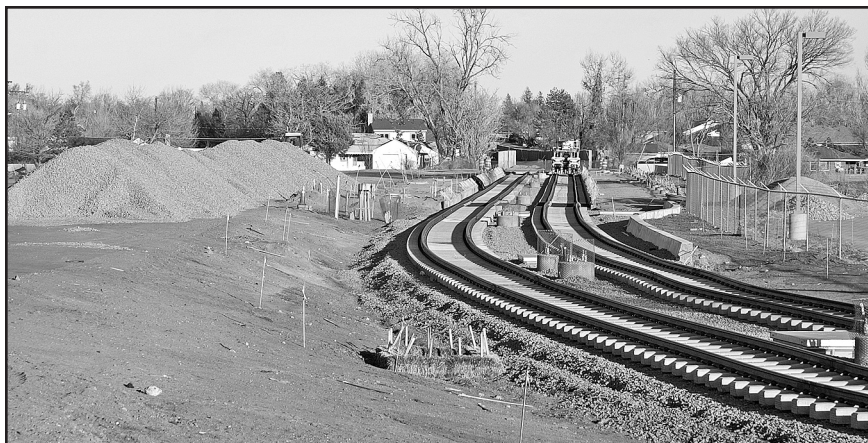
Eastward view of the Oak Street station stop on the RTD West Corridor line under construction on March 1, 2011.