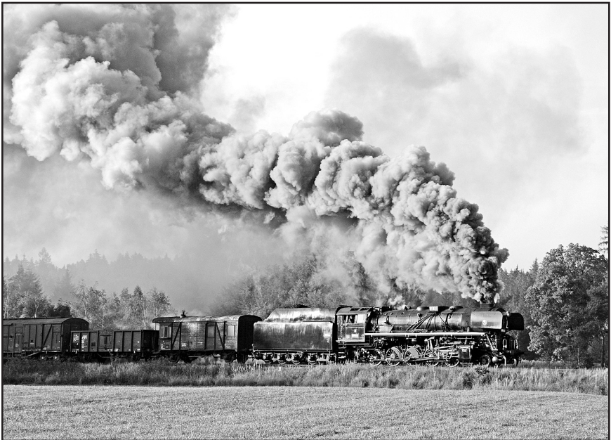
A 556 class 2-10-0 with it's thundering exhaust leading a freight train in the Slovakia mountains.